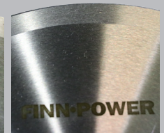
Smooth blade as an option.

FURTHER INFO ON PRODUCTS, PLEASE REVERT TO SPECIFIC PRODUCT CARD