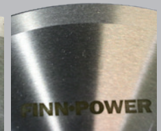
Smooth blade as an option.

FURTHER INFO ON PRODUCTS, PLEASE REVERT TO SPECIFIC PRODUCT CARD