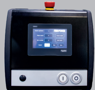
Touchscreen as standard feature

FURTHER INFO ON PRODUCTS, PLEASE REVERT TO SPECIFIC PRODUCT CARD