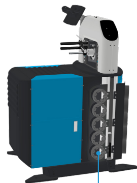
Side die rack as an option, 5 slots (Compact only)