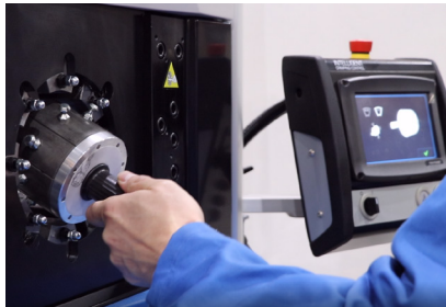
Die sets can be installed into the master dies with a QuickChange-tool one set at a time.