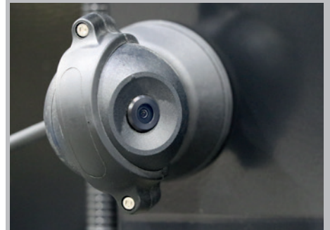
Camera as a standard feature.

Oil Condition Monitor OCM Safety scanner Adapter dies (for 160-series die sets) Oil cooler