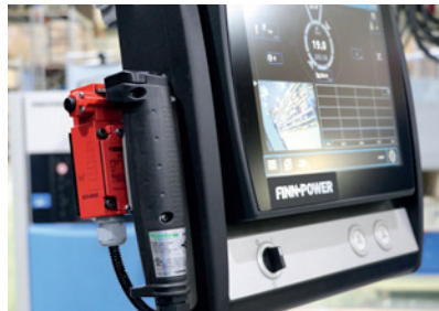
Remote control unit as a standard feature.