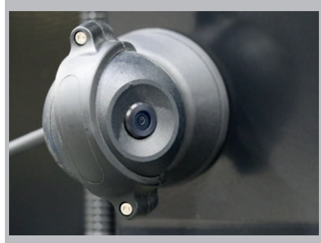
Camera as a standard feature.