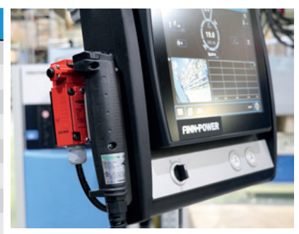
Remote control unit as a standard feature. D-marking