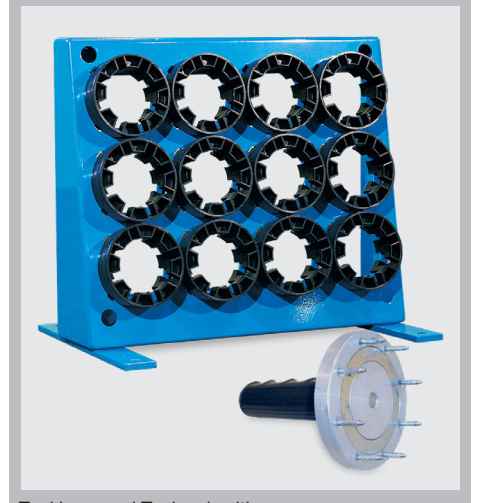
Tool base and Tool rack with QuickChange-tool as an option.