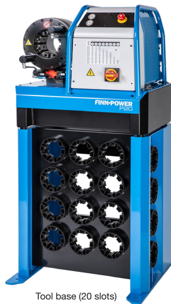
Tool base (20 slots)