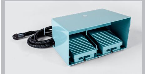
Foot pedal as an option (factory installation only).