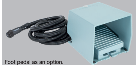
Foot pedal as an option.