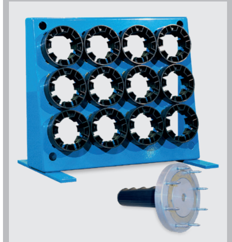
Tool base and Tool rack with QuickChange-tool as an option.