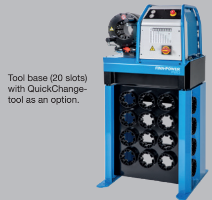
Tool base (20 slots) with QuickChange-tool as an option.