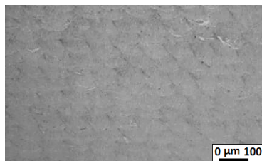
Microstructure after stress relief